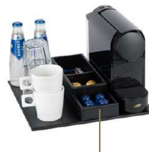
Set up 2: Box on top of tray, in the middle