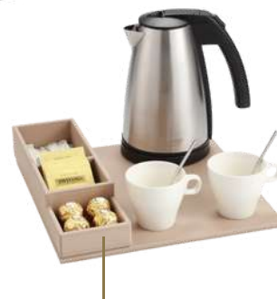
Set up 1: Box on top of tray, on the left side