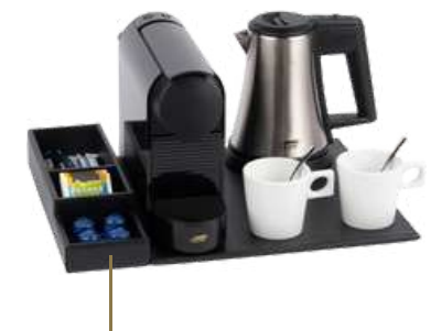
Set up 4/5: Box next to tray, on the left/right side