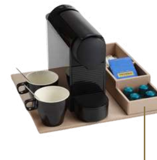
Set up 3: Box on top of tray, on the right side