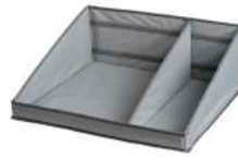
Divider Green Hotel