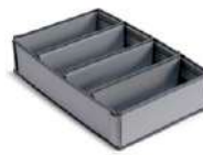
Divider Magic Hotel